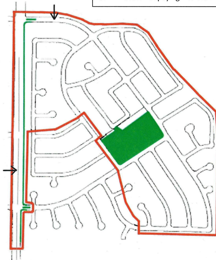
MONTEBELLO MAINTENANCE ASSESSMENT DISTRICT